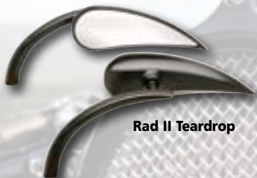
Rad II Teardrop