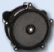
SUPER GAS AIR CLEANER