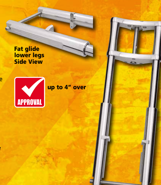
New Style Triple Tree

Forks are available upon request!Standard (790 mm Wheel Axle Center Lower Surface Upper Triple Tree)